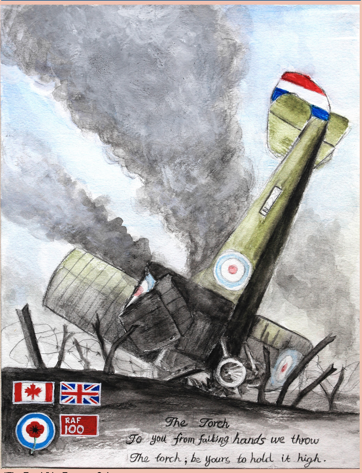
"The Torch" by Terence Cai